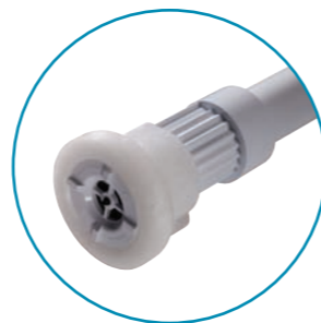
Float Switch For automatic shut-off