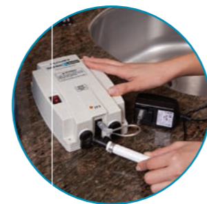
Easy to Install New quick connect port/fittings